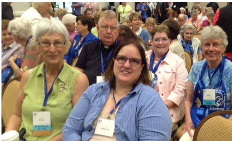
Members of MDCCW attending the 2015 NCCW Convention in Orlando, Florida.