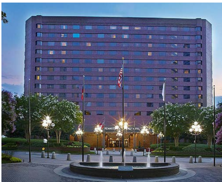
Renaissance Atlanta Waverly Hotel & Convention Center

Our nationally acclaimed Leadership Training Development Team (LTDT) provided an informative and entertaining summary of what they can present to help councils grow. The education committee talked about the Rose Program that can be used in your councils.