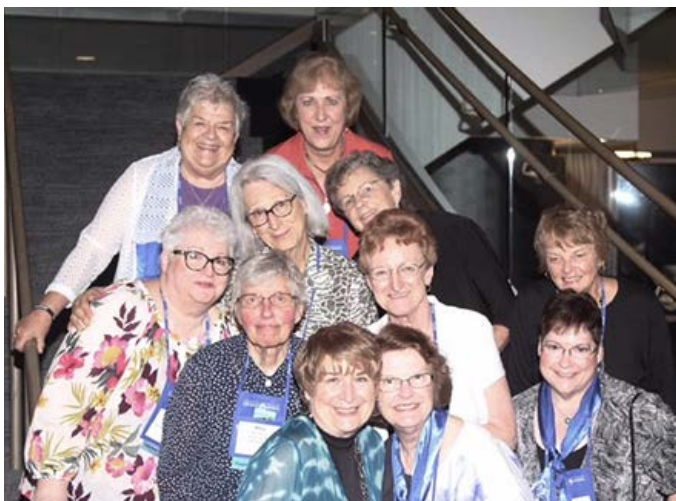
Eleven women from the Madison Diocese participated in the 2018 NCCW convention in Pittsburgh.