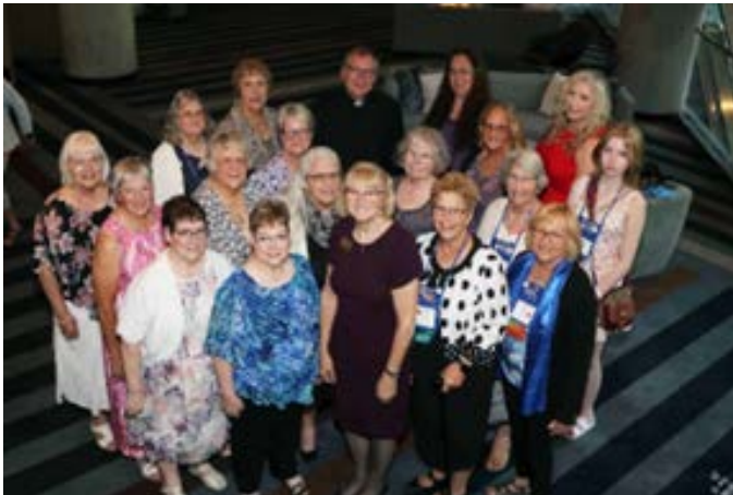
Convention attendees from Wisconsin pose for a photo at the closing banquet.